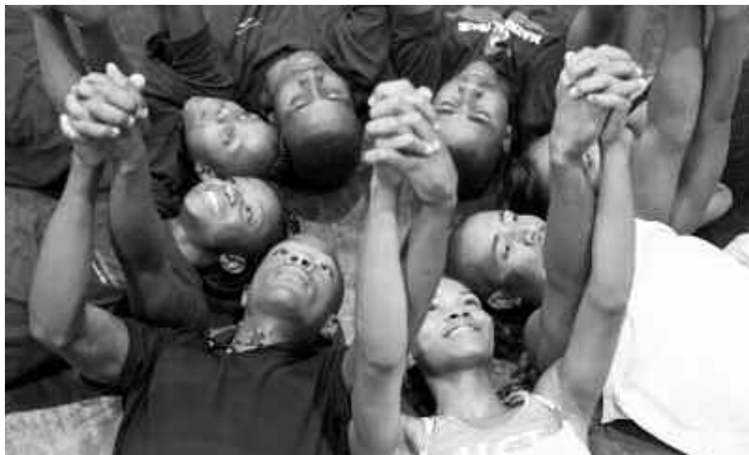
Above: Sadler's Wells Ctrl. Alt. Shift project.

The next production for Connect is Destino, a landmark collaboration with Dance United and choreographers Hofesh Shechter and Russell Maliphant involving 120 local people from Islington. Destino can be seen at Sadler's Wells on 12 & 13