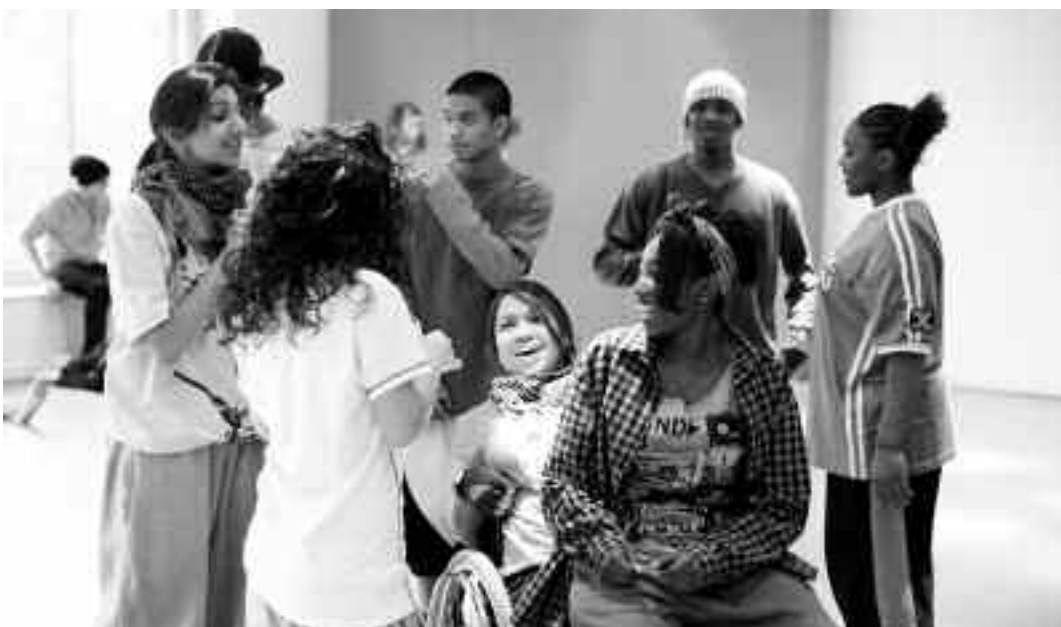
All pictures: Sadler's Wells Ctrl. Alt. Shift project.

To inspire and engage the target audience about HIV/AIDS issues, we