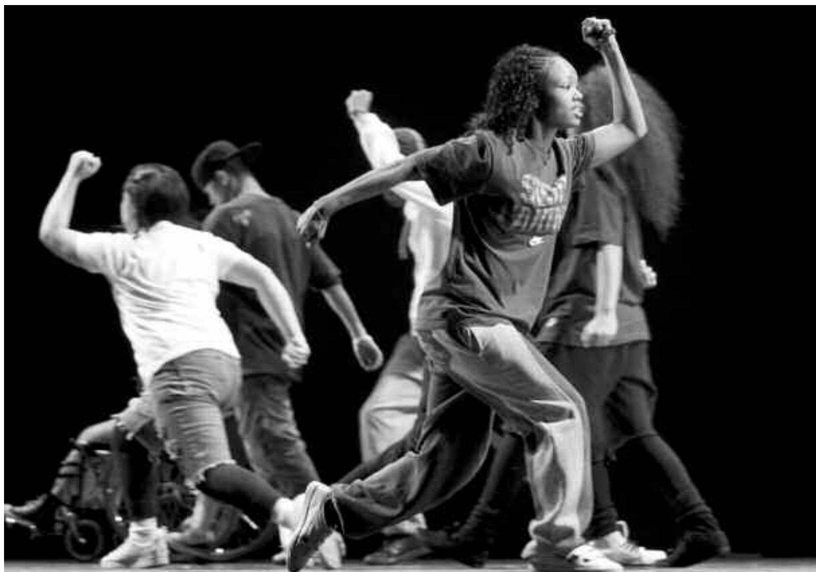
Above: Sadler's Wells Ctrl. Alt. Shift project.